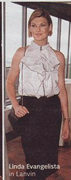
Linda Evangelista in Lanvin