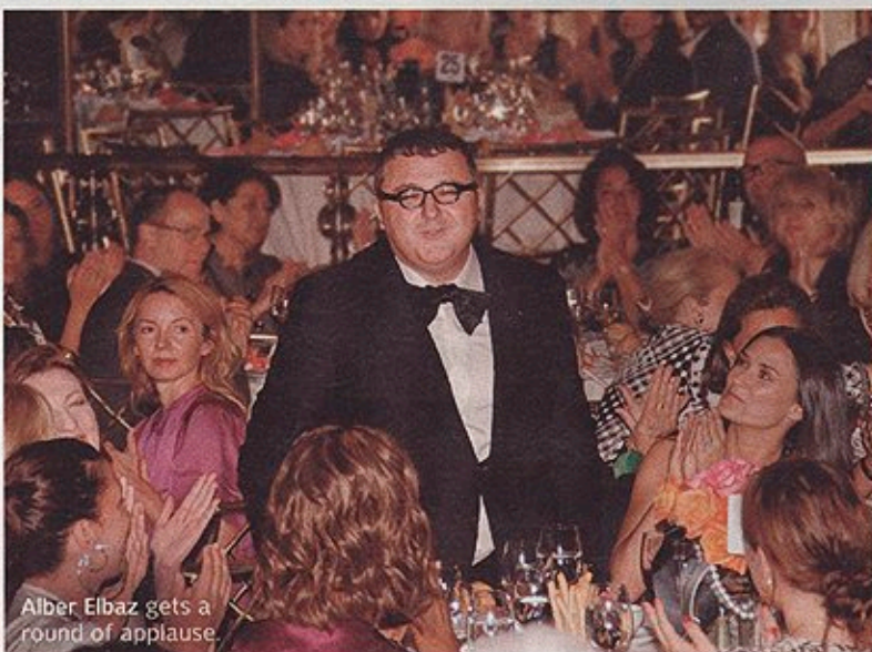
Alber Elbaz gets a round of applause.