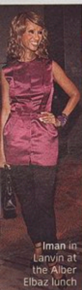
Iman in Lanvin at the Alber Elbaz lunch

"I am so happy you are smoking too," Versace said