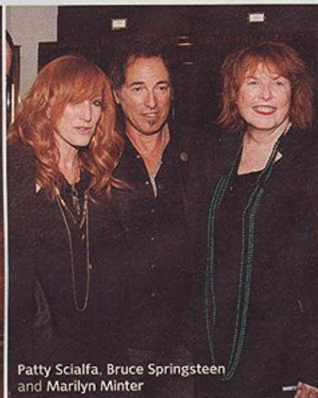
Patty Scialfa, Bruce Springsteen and Marilyn Minter