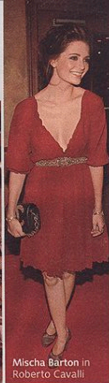
Mischa Barton in Roberto Cavalli