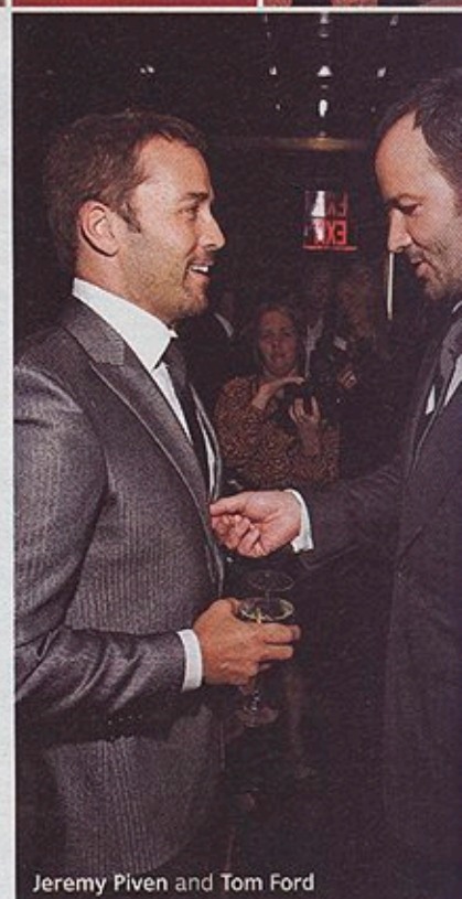
Jeremy Piven and Tom Ford